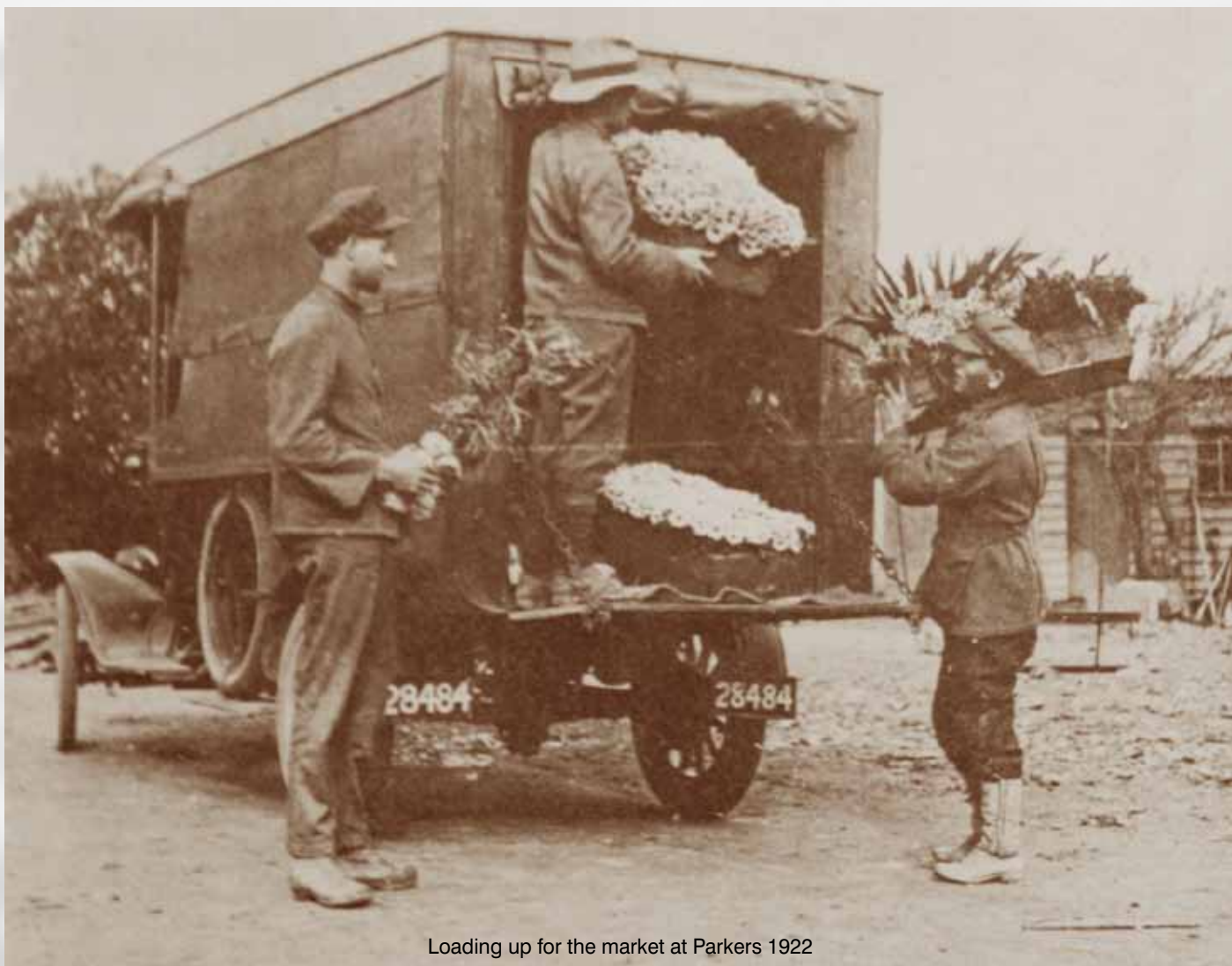
Loading up for the market at Parkers 1922