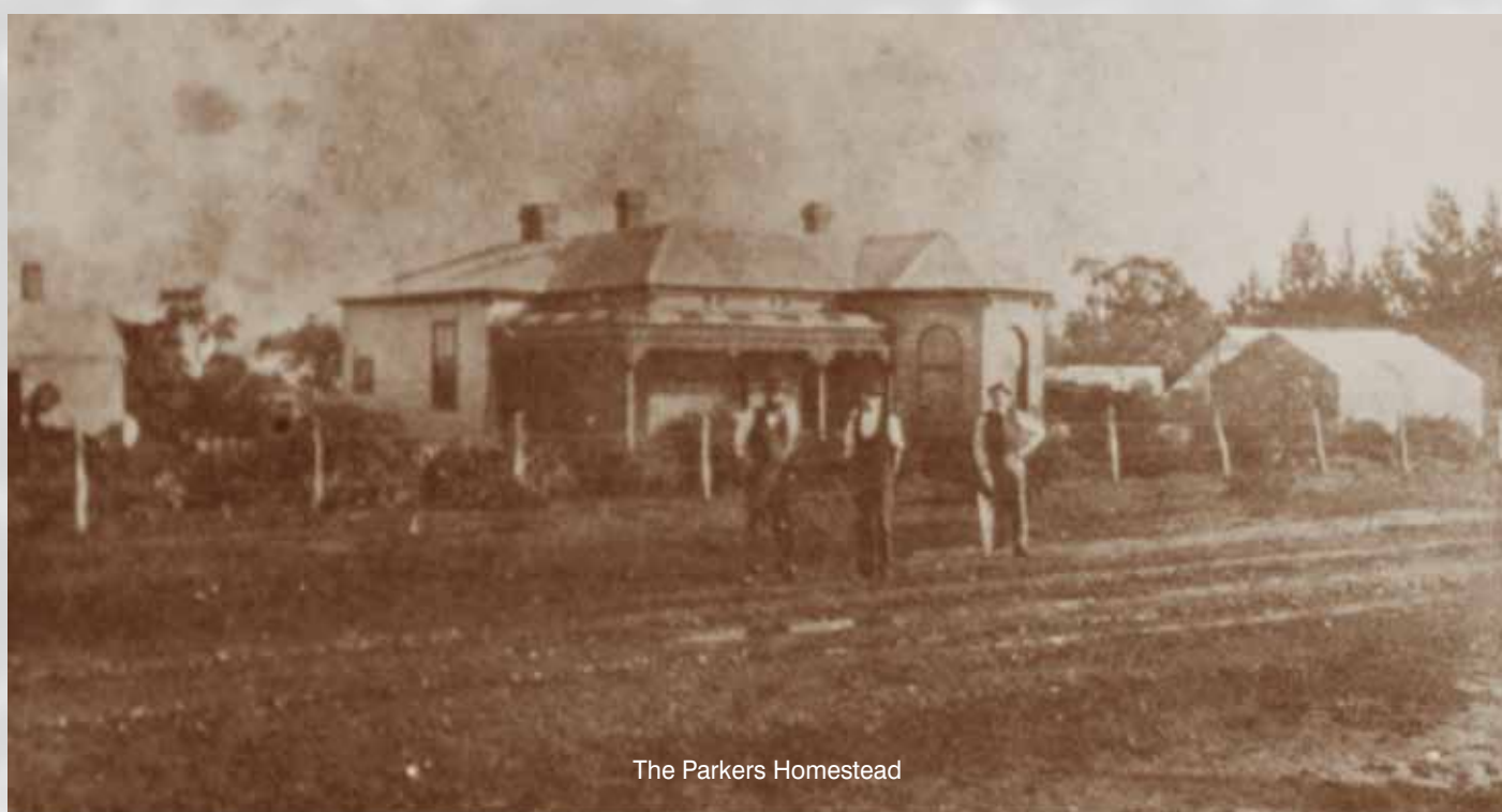
The Parkers Homestead