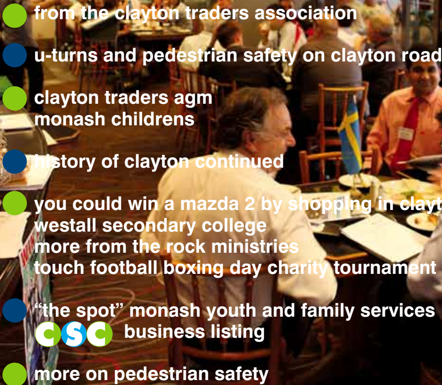
Clayton Traders Association AGM 2010